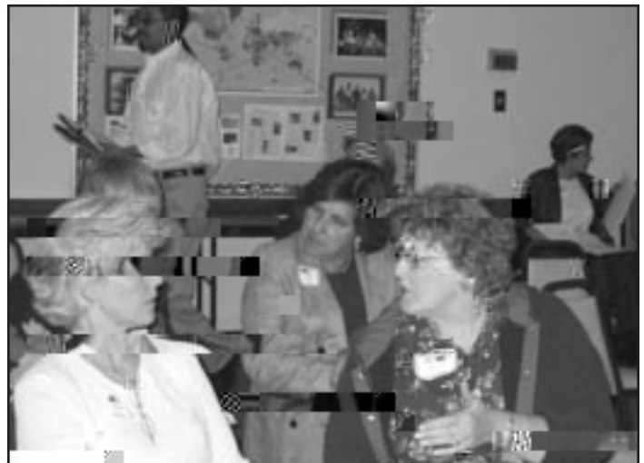
2003 CAIRS Conference, taxonomy workshop.

Certified Information and Referral Specialist (CIRS), Certified Resource Specialist (CRS) testing and the all-new Certified Information & Referral Specialist-Aging (CIRS-A) test - AIRS Certification Testing will be available in Sacramento, CA on January 15, 2004.