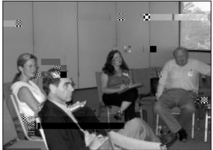
2003 CAIRS Conference, call-statistics workshop.